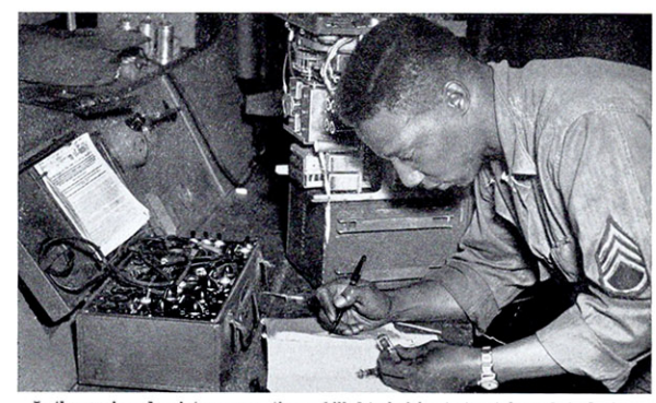
In the repair and maintenance section a skilled technician tests a tube socket adapter